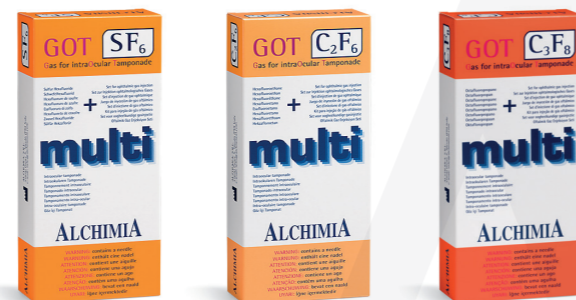
GOT 007 GOT 008 GOT 009

Each pack contains 1 gas cylinder + 1 gas injection set + 1 needle and 1 patient's wristband