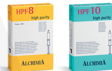
HPF 019 HPF 021